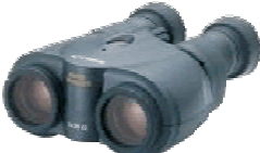
Image Stabilized Canon Binoculars