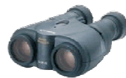
Image Stabilized Canon Binoculars